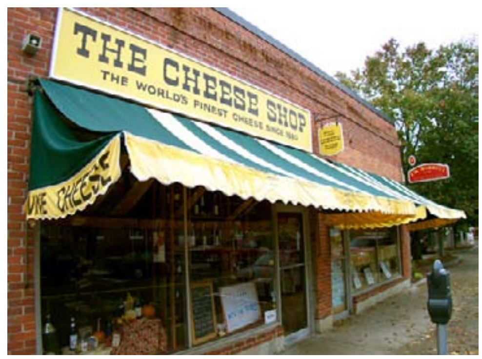
The Cheese Shop is a great place to find afternoon snacks.

Finally, remember that there are many other students in your position. Be sure to be outgoing during orientation, and feel free to ask for advice, directions, or help from teachers, upper classmen or other classmates once the school year begins.