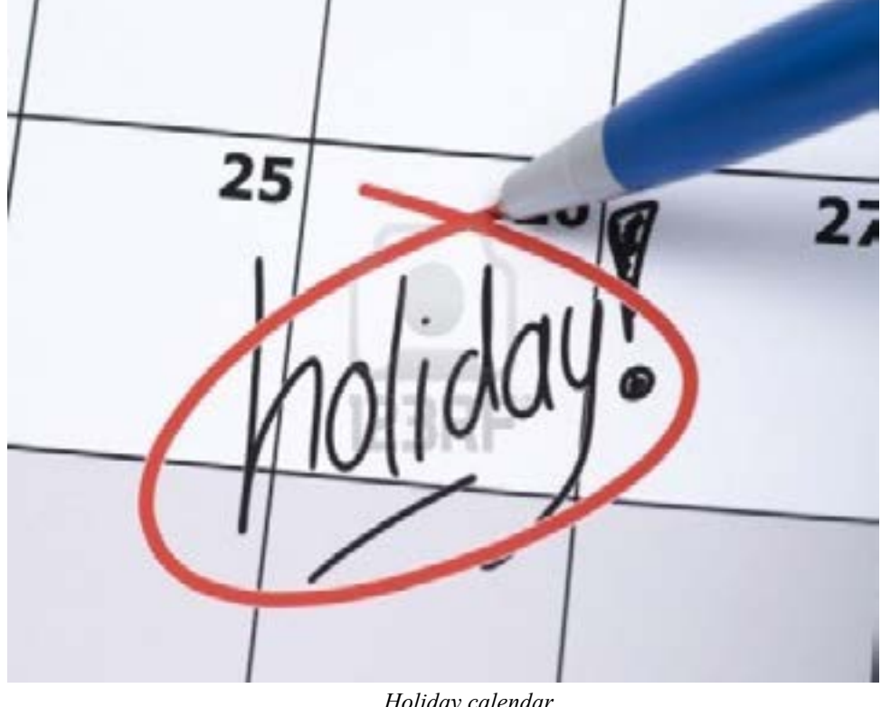
Holiday calendar