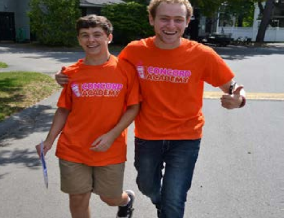
Orientation Leaders getting ready to begin orientation activities

As Orientation went on, I began to notice a growing theme. In being completely im-