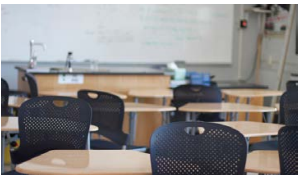
The new furniture in the CA classrooms.

Academy's style for as long as Kingman has been here. Both the flexibility of classroom arrangements and the uniformity of appearance had been compromised for years. "We looked like a tag sale!" exclaimed Kingman "We've got three of these, we got one of