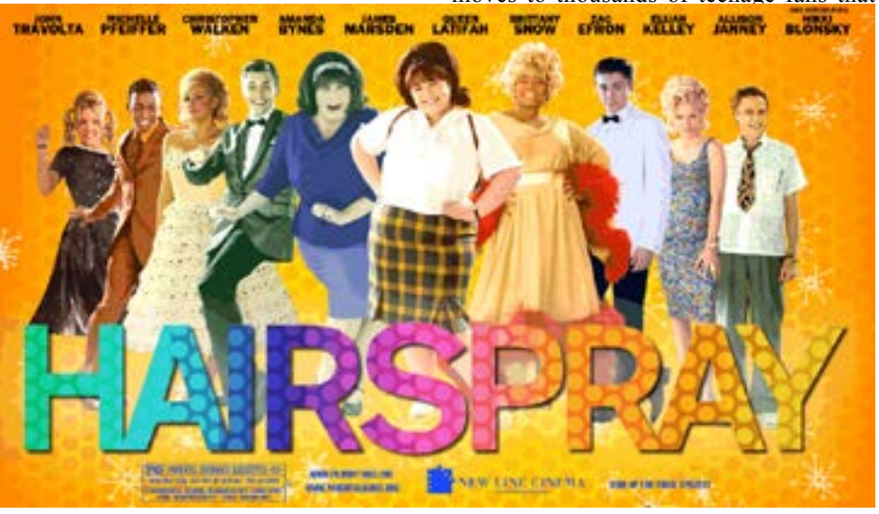
Hairspray Movie Poster.

The musical has been particularly popular because it illustrates the power of music and dance, so integral to American culture, regardless of race, gender, age, or body type. In the musical, various groups struggle with discrimination, but all are brought together by a shared passion: a popular TV show called The Corny Collins Show. This show, broadcast from downtown Baltimore, epitomizes the popular dance scene. The show's cast of enthusiastic, stereotypical white teenage dancers introduces new popular dance moves to thousands of teenage fans that