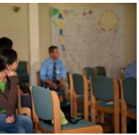
Old furniture in the Ransome Room.

zations there that distribute it to school who need them." Even more miraculously, Kingman also estimated that only about 10 pieces of furniture were discarded to the trash, about 1% of the total furniture. "It was just outdated," Kingman added.