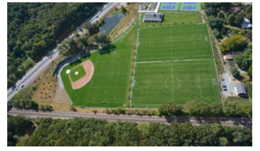
The Moriarty Athletic Campus.