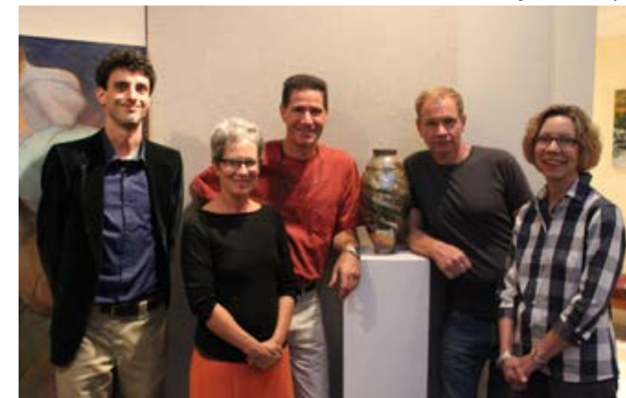
Concord Academy visual arts department teachers stand in the CPL gallery next to their artwork.

variety of eye-catching patterns of flames, solid blacks, and shades of blue. Lined neatly against the perimeter of the gallery were colored pictures, paintings, and collages. There was also a short film loop with headphones, where one could hear the faded and eerie voice of a man telling a broken