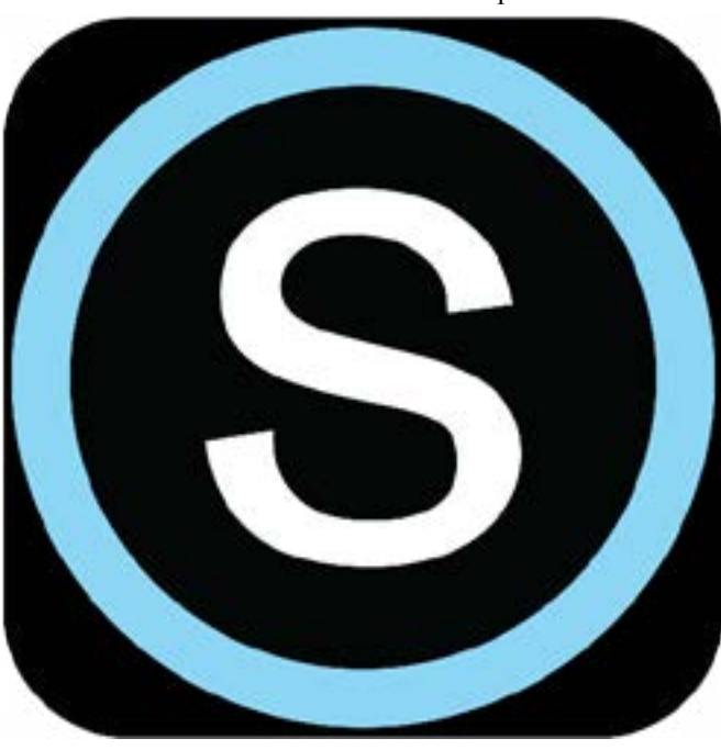
Schoology Logo.

most famous, most used forum tool that there is on the Internet right now." This forum program was chosen in order to give CA students experience using a variety of technology, thereby furthering the authenticity principle. Every club has a forum page (these replace club